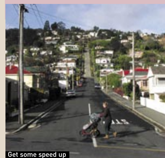
Get some speed up

IS Baldwin Street really the steepest street in the world? You have to suspect not — there must, for instance, surely be steeper streets in the favelas of Rio de Janeiro or the Chilean city of Valparaiso. Even Britain's steepest public road, at Harlech Castle, comes close to Baldwin Street with a maximum gradient of one in 2.91. One of the problems in determining the world's steepest street is that the figures (like all statistics) are iffy. While previous measurements had Baldwin Street's maximum gradient at 38 per cent, the most recent Guinness Book of Records entry says 35 per cent. Going by this figure, a steeper street exists in Pittsburgh. According to the city's Department of Engineering and Construction, Canton Avenue in the suburb of Beechview reaches 37 per cent. Chances are there's an even steeper stretch of un-surveyed road in some backwater. But until the Guinness Book of Records updates this entry, who are we to argue with the late Norris McWhirter that Baldwin Street sits atop the pile?