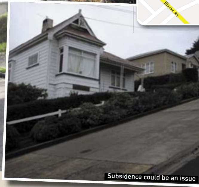
Subsidence could be an issue